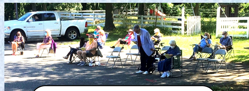
SOCIALLY DISTANT WORSHIP